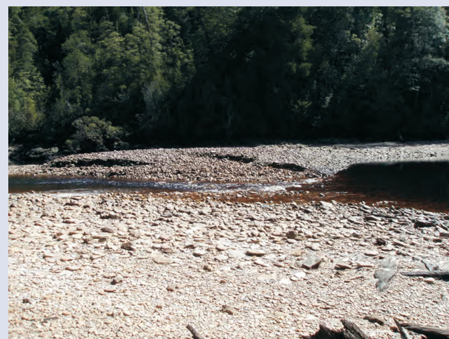
Bank attached lateral bar in Zone 1 comprising of a cobble matrix with classic imbrication visible in the foreground